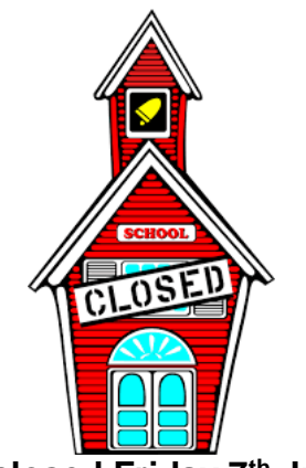
School closed Friday 7th July 2023

Friday 21<sup>st</sup> July: School breaks up for the Summer holiday.